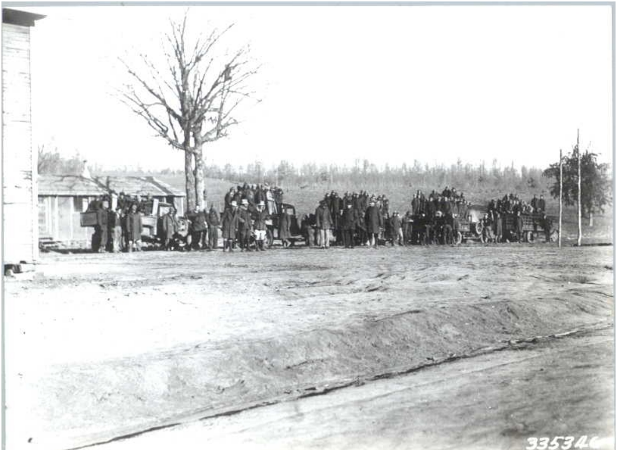
CCC Boys, early morning, going to work, Camp Moore, November 1936.

As are many historic sites on the Ozark-St. Francis National Forests, this site has been recorded with the Arkansas Archeological Survey as 3NW0609. According to the CCC Alumni website, this camp is Company #745, Project #F-24, and organized on 31 May 1933. http://www.cccalumni.org/states/ARKANSAS.html . The project number was assigned by the state. The F indicates a National Forest Project. The camp newspaper was called the Moore Breeze. The camp was located west of Richland Creek in Jones Township, in SE corner of Newton County and north of the communities of Ben Hur and Moore.