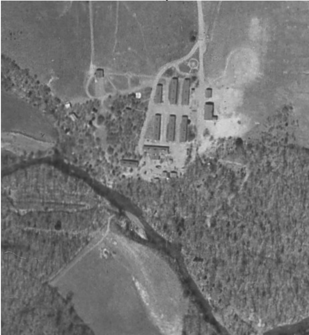
Enlarged from Ozark National Forest, March 31, 1937, aerial photo GD 31-84.